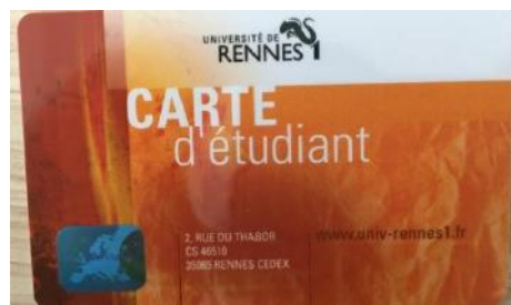
Figure 4: Front of the UR1 Student card including the ESC hologram.

The adaptation also required in some cases some technical adaptations or adjustments. For instance, it was not possible to automatise the process at UR1 for the personalised QR code integration on the cards. The IT department developed an application to gather the QR code issued by the ESC-Router on the one side and the student information issued by the student management system on the other side. The application not being “user friendly” was also an issue, as the student office that usually prints information on the card could not use it. This is why the IT department at UR1 produced the student cards for mobility students only. Those cards (see figures 4 and 5) were then printed by the student offices and afterwards sent to the mobility students. Via this process, 330 students received – in addition to their regular student card – a European Student Card, including the QR code. Although imperfect, this solution allowed UR1 and the EDUCardS consortium to test the issuing process of the ESC. Below you will find a sample of an ESC created at UR1: