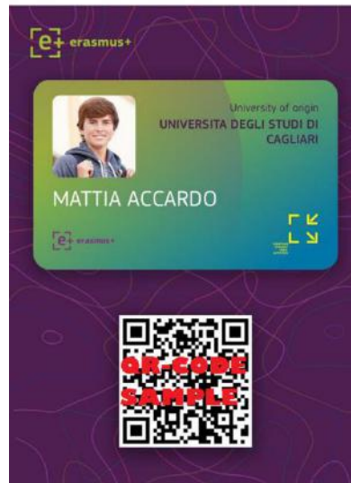
Figure 6: Virtual ESC example from UNICA.

However, generating ESCs with the Erasmus+ App does not allow universities to access data on how many cards have been created.