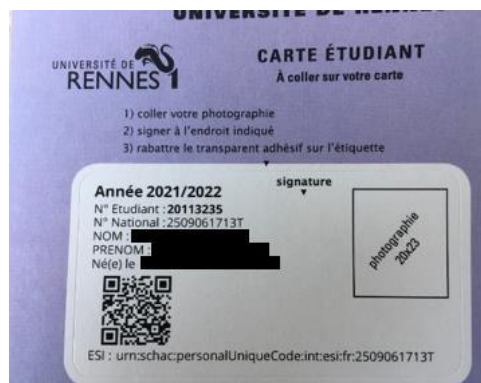
Figure 5: Back of the UR1 student card including the ESC QR Code.